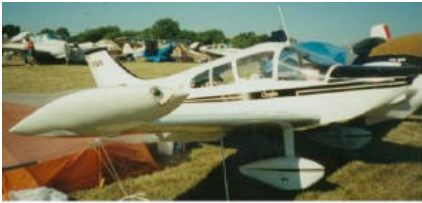
Photo is NOT the actual plane for sale but is similar.

Moving Day ??? Now, a bit left, oops – now right, back left