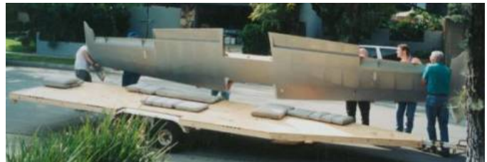
One piece wing section, trailer not included

For details contact Fred Leonhardt, (714) 870 4855