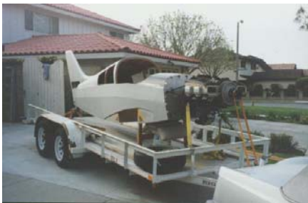
Fuselage with engine, trailer not included.

Good visibility, spacious cockpit with ample baggage capacity, excellent range, great economy & speed